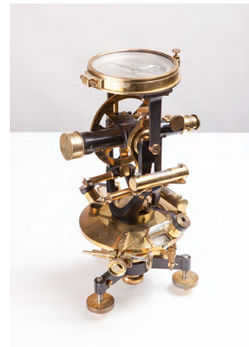
78 CHF 6'800