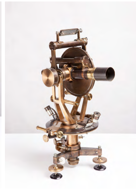
77 CHF 14'800