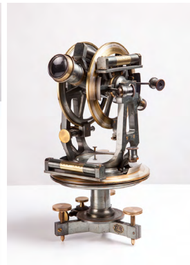
80 CHF 6'500