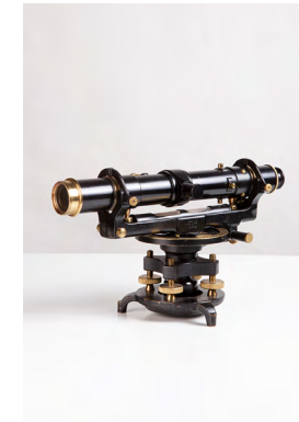
28 CHF 3'900

Rue Verdaine 11 · 1204 Geneva · +41 22 508 10 38 · info@madgallery.ch www.madgallery.ch