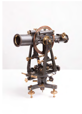
68 CHF 9'800