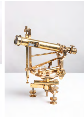
146 CHF 5'900

63 Theodolite with compass and eccentric telescope, brass and metal. Signed "SUSS N. - Budapest" n° 1121, early XX century.