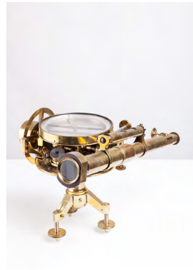
63 CHF 6'500