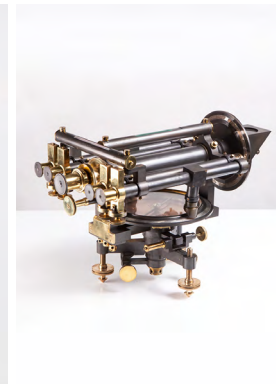
128 CHF 24'800