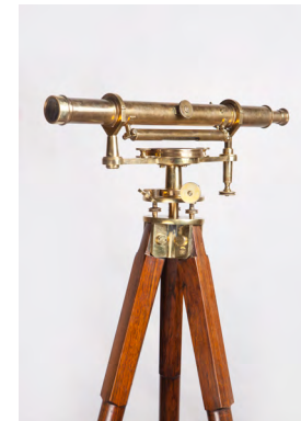
116 CHF 11'800