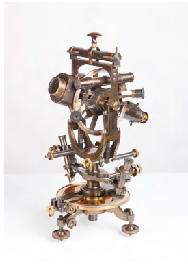
65 CHF 12'800