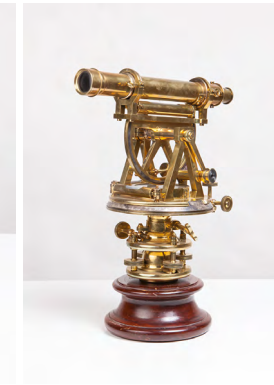
56 CHF 5'900