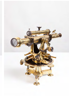
104 CHF 5'900