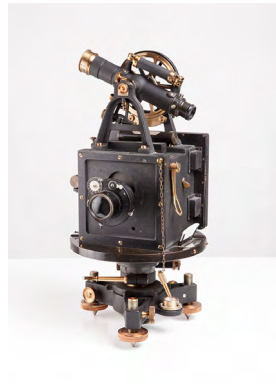
64 CHF 38'500