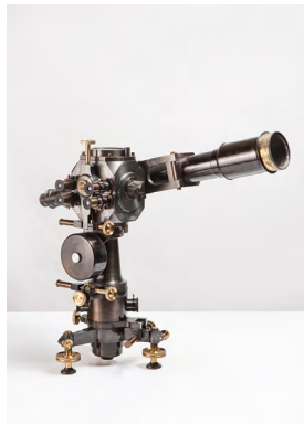
70 CHF 24'500