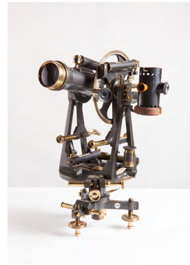
74 CHF 13'800