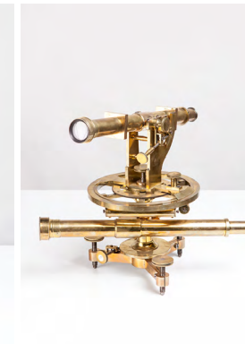
60 CHF 8'800