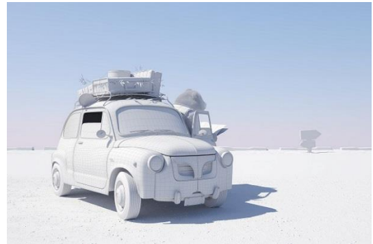
Preview Rendering for Lighting Setup