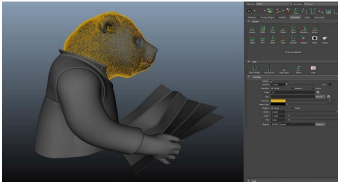
Grooming the Panda's Fur