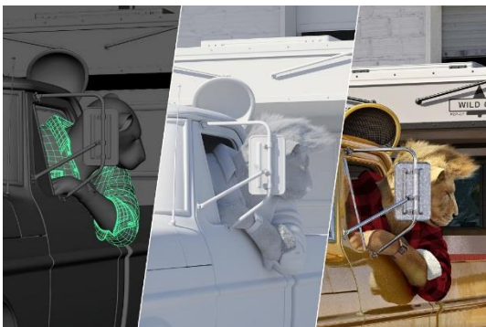
3D-Preview / Testlighting / Final Image

The process is not at all smoothly linear, each step requires several testing phases to produce the finished image Müller envisions. It takes lots of time to integrate the countless details: the “Rides of the Wild” series took nearly three years to complete from start to finish.